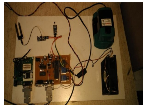
Fig. 1. Example of an image with acceptable resolution

4. By using ARM 7 and ARM 9 we can increase the range of system using internet or Wi-Fi. There processers will benefit addition of features such as GSM module, pH level sensor, automatic threshold level controlling, etc. Also with these processor robots can be added to the system making it roam about in the greenhouse detecting values at different places or spots.